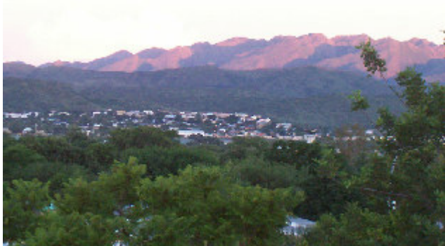
Streams in the desert have enhanced the beauty of this Windhoek suburb as evening settles in

Presently, there are seven students enrolled, an increase of four from last year. Some are active in pastoral ministry; others are new in their Christian walk. However, they have heard the gracious call of the Master to be co laborers with Him! Although the numbers are small, streams of His presence are beginning to flow in greater measure! Keep praying with us for more men and women to be trained for ministry here in Namibia. The need is great!