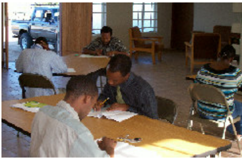
Students taking their final exams